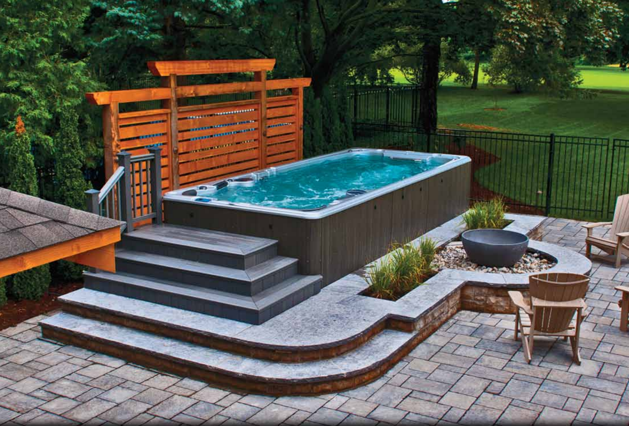
4) Stand Alone Installations