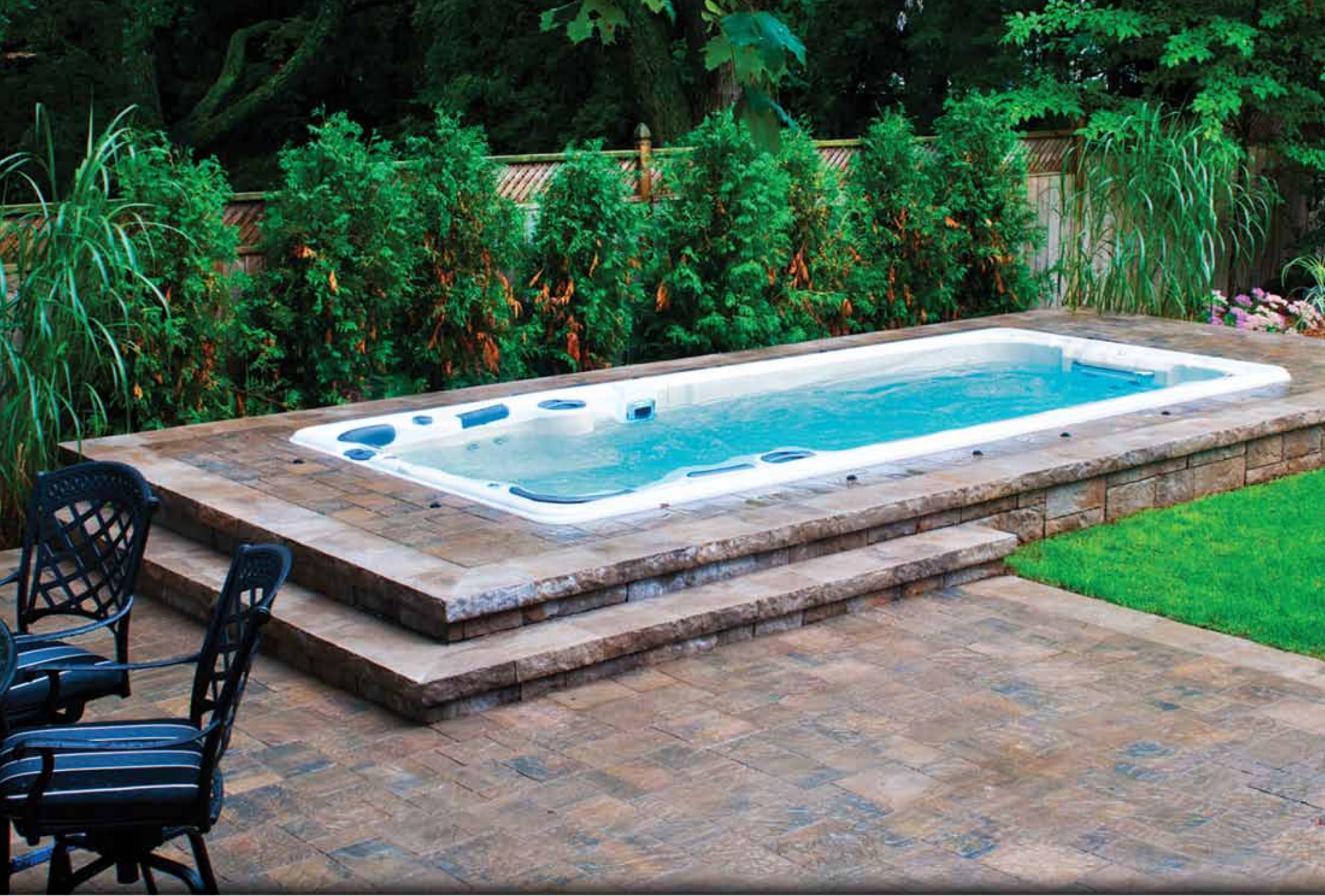
3) Half & Half Installations