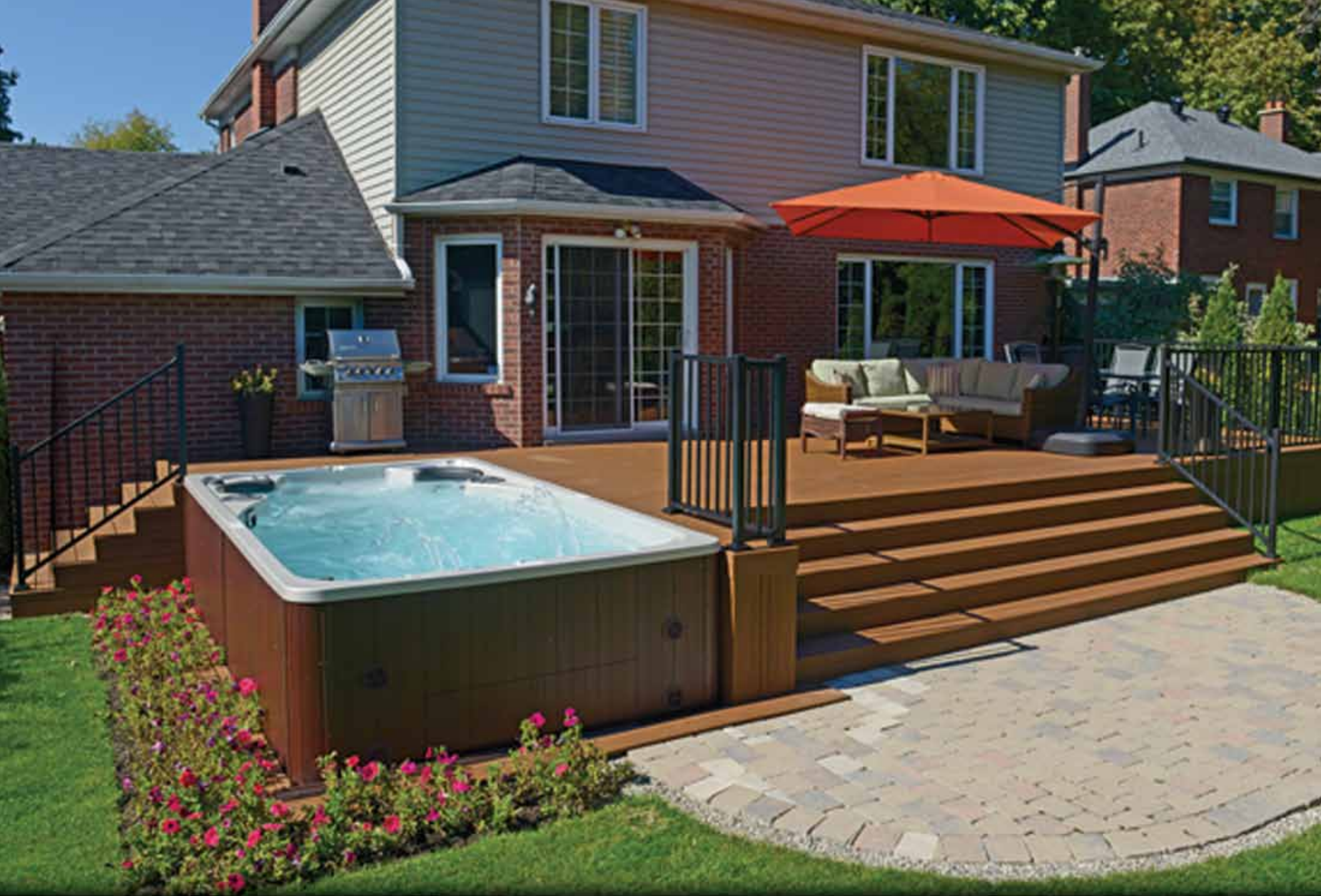
1) Edge of Deck Installations