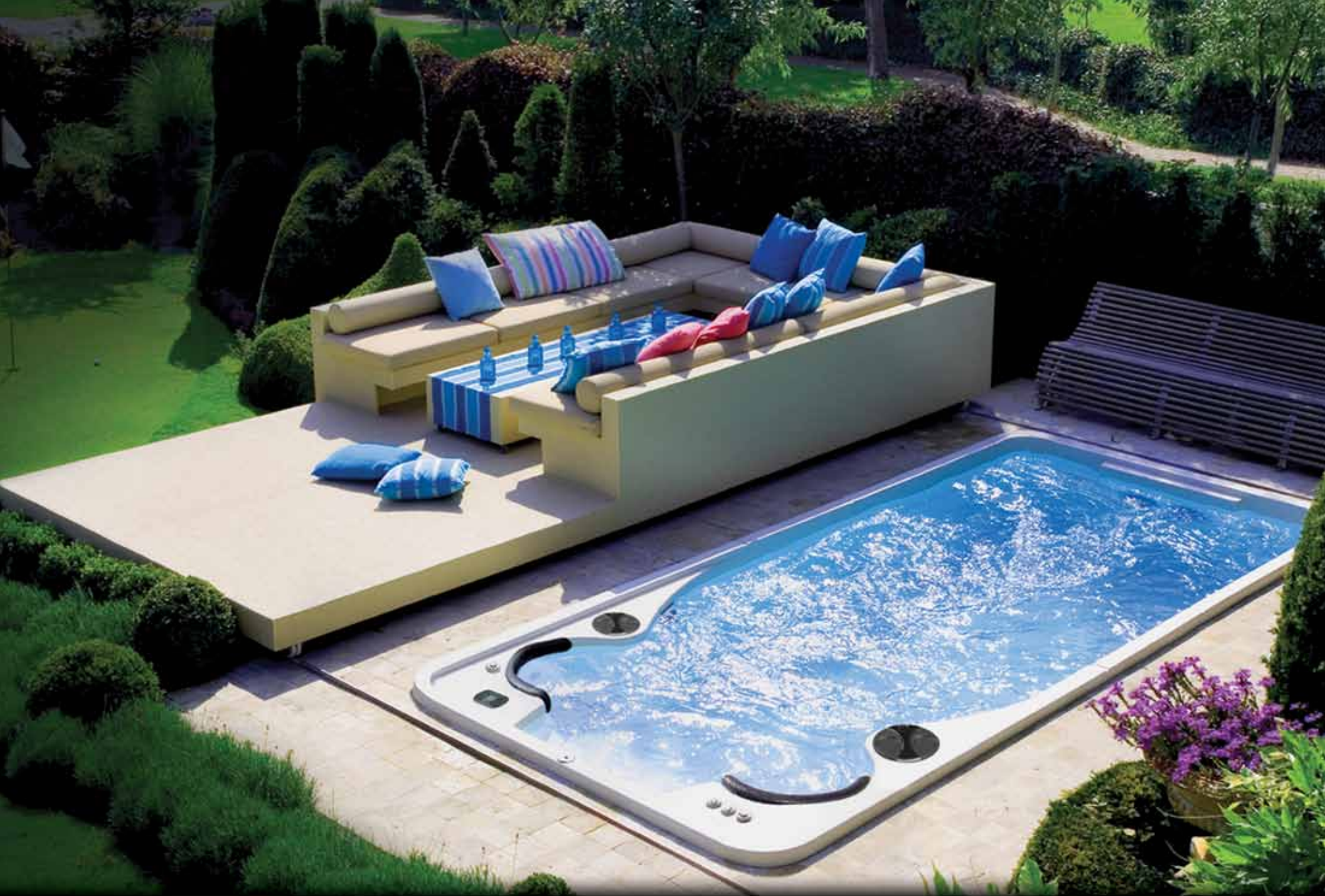
2) In Ground Installations