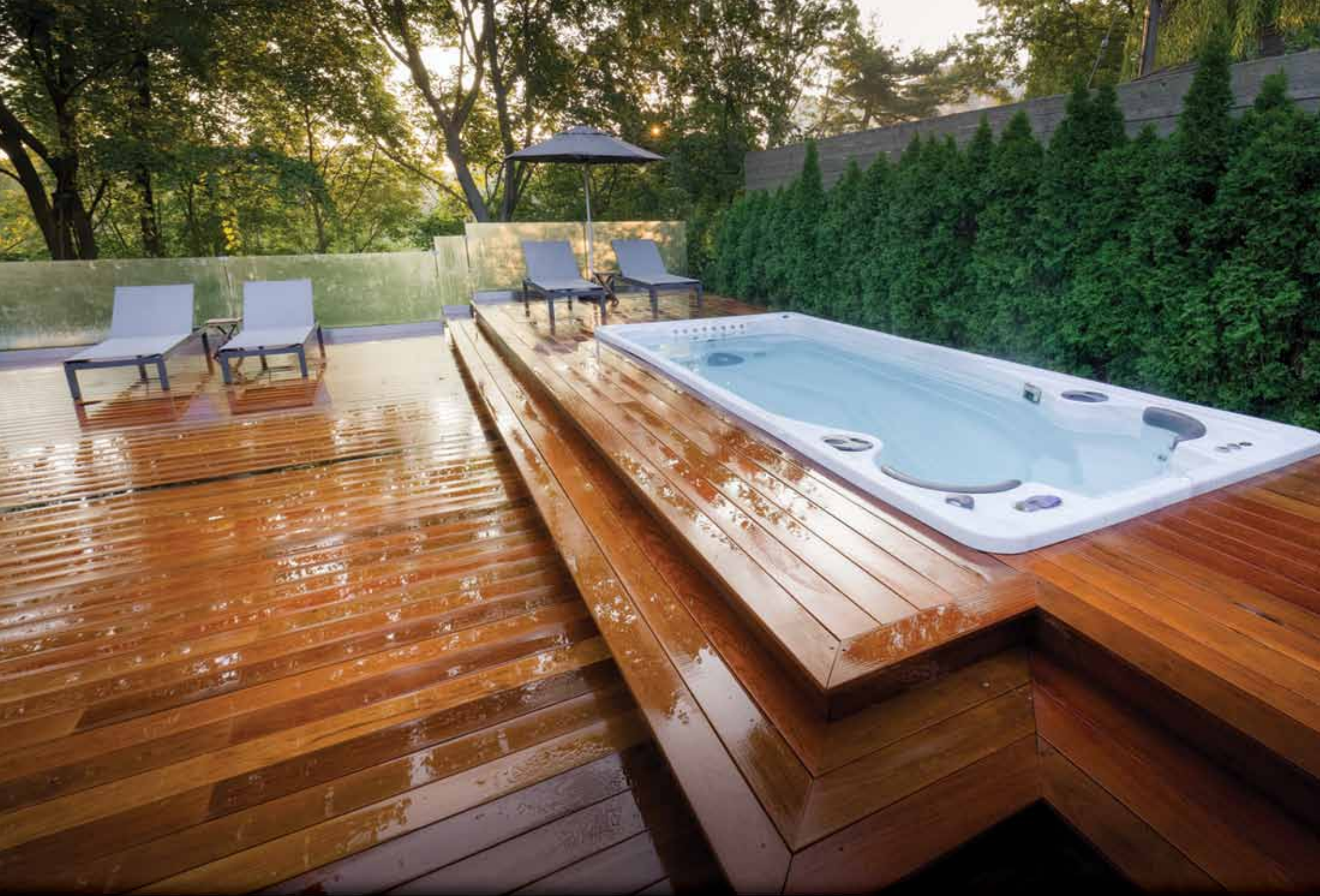
5) Raised Deck Installations