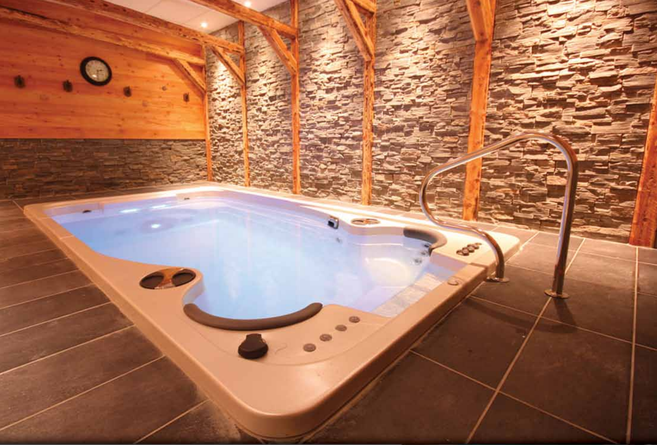
6) Sun Room or New Room Addition Installations